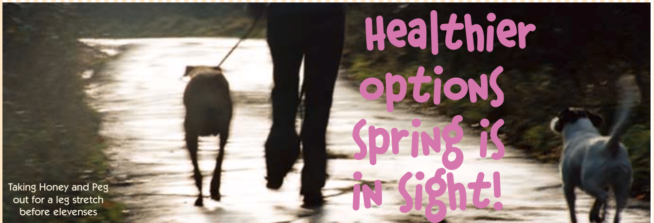
Taking Honey and Peg out for a leg stretch before elevenes