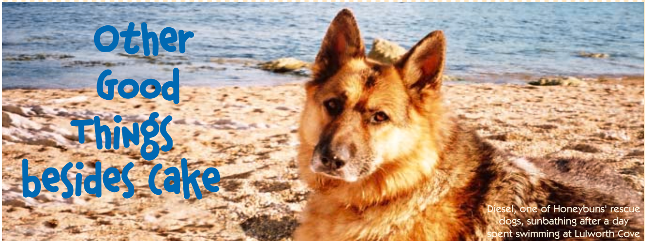
Diesel, one of Honeybuns' rescue dogs, sunbathing after a day spent swimming at Lulworth Cove

We are taking care to implement as many environmentally considerate measures as we can in 2006 and beyond. We started the New Year with a solar powered security light. We have also set aside a strip of land grazed by our goats, Margot and Hilary, to create a Goldfinch Sanctuary. These lovely little birds are becoming increasingly rare as the thistle heads they feed on are disappearing. We will be encouraging the birds back by allowing the thistle to spread and by installing nesting boxes ready for the Spring.