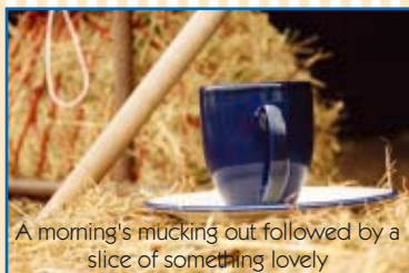
A morning's mucking out followed by a slice of something lovely